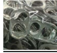
Pop tops from cans